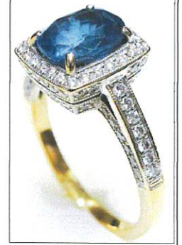
Not actual sizes