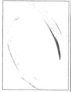
Not actual sizes