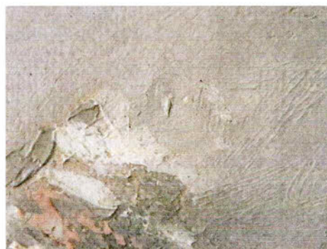
Detail after treatment

The images of the treatment performed are included on a compact disk accompanying the report. Digital images used do not present the true colour of the original artwork.