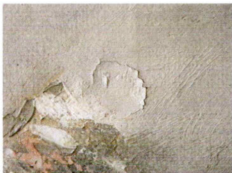
Detail before treatment

Unstable areas, where the paint was lifting, were faced using Japanese tissue and rabbit glue. The painting was removed from the stretcher. The edges of the canvas were flattened using humidity particles and weights. The rear of the canvas was given a dry clean. A small tear in the canvas, located in the top left quadrant was reinforced at the rear with a linen canvas patch and Plextol B500. The facing was removed from the paint surface with cotton swabs dampened with distilled water. Consolidation and flattening of the lifting areas of paint was done using Sturgeon glue and a warm spatula. The paint surface was cleaned using cotton swabs with distilled water and a surfactant. A strip-lining was performed, which involved adhering linen canvas strips around all four edges of the canvas with Plextol B500. The stretcher was cleaned and the painting was then re-tensioned onto the stretcher using cotton tape between the canvas and the staples. Eight new keys were inserted and secured. The paint losses were filled with a plaster made of gesso powder and rabbit glue. Retouching of paint losses was done with watercolours. Varnish layers were applied. Final retouching was done using pure pigments and varnish.